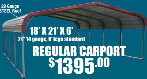
29 Gauge STEEL Roof