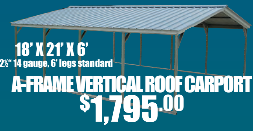
18' X 21' X 6' 2 1/2" 14 gauge, 6' legs standard