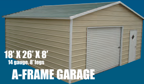
18' X 26' X 8' 14 gauge, 8' legs