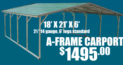
18' X 21' X 6' 2 1/2" 14 gauge, 6' legs standard