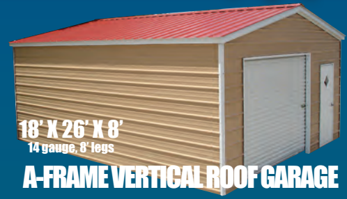
18' X 26' X 8' 14 gauge, 8' legs