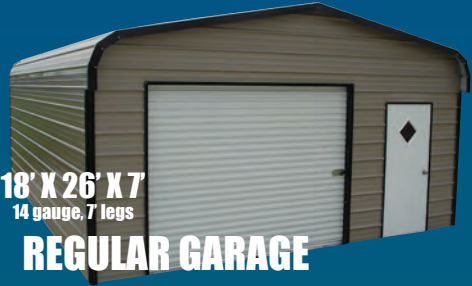
18' X 26' X 7' 14 gauge, 7' legs

Before You Buy Anywhere Else, Compare Our Installation Schedules and Value-Added Standard Features!