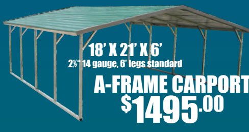
18' X 21' X 6' 2 1/2" 14 gauge, 6' legs standard