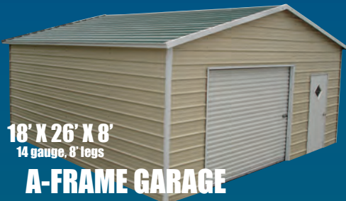
18' X 26' X 8' 14 gauge, 8' legs