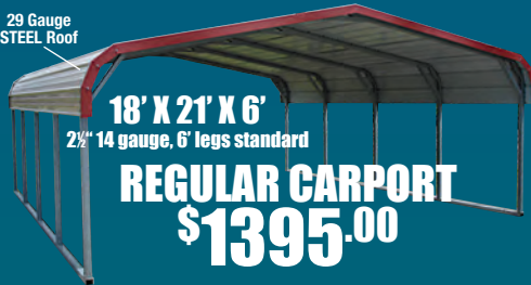
29 Gauge STEEL Roof