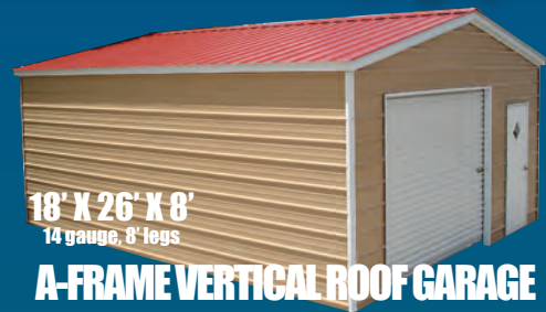
18' X 26' X 8' 14 gauge, 8' legs