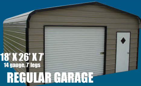
18' X 26' X 7' 14 gauge, 7' legs

Before You Buy Anywhere Else, Compare Our Installation Schedules and Value-Added Standard Features!